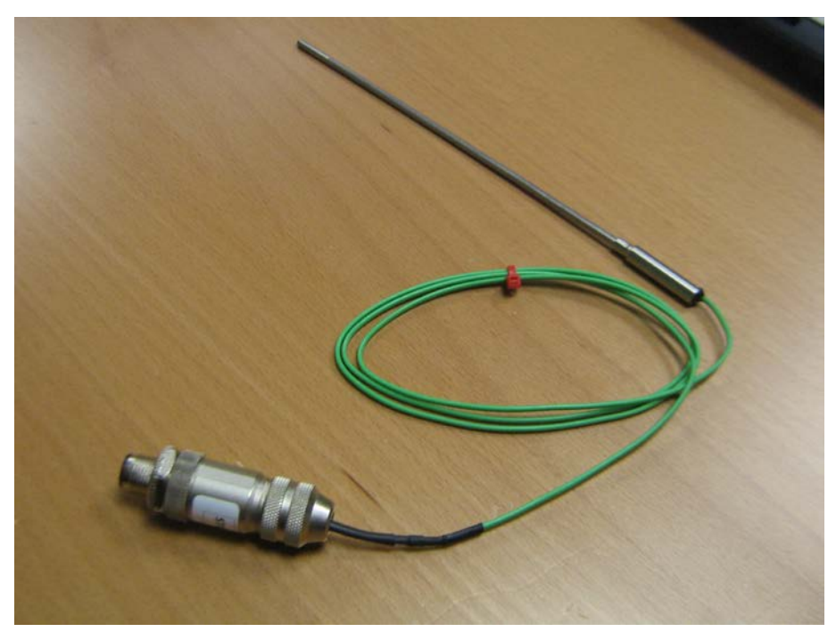
Figure 17: STC01-002 probe (delivered with a connector)