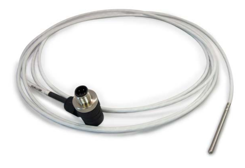
Figure 6: PFPN-STE32-001 PT100 probe