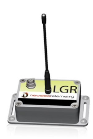
Figure 3: LGR casing