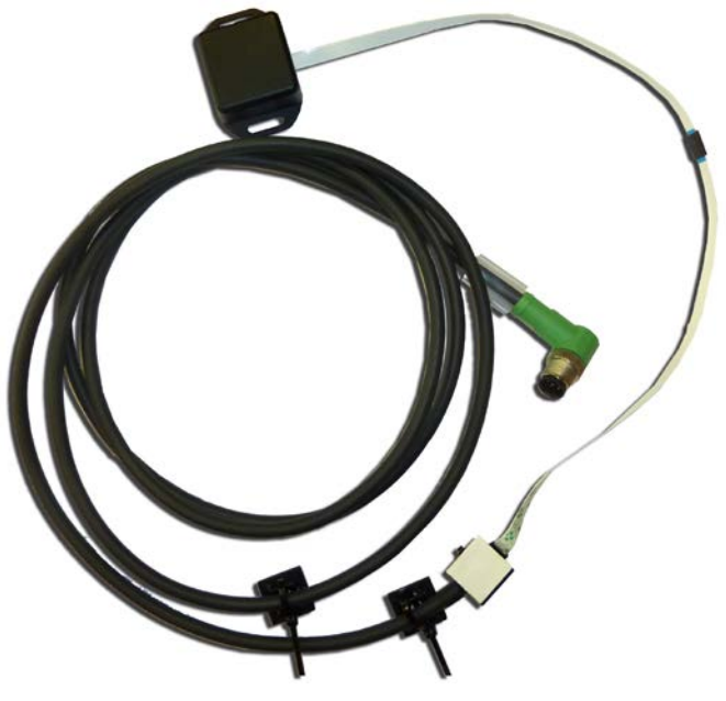
Figure 13: PFPN-STE51-004