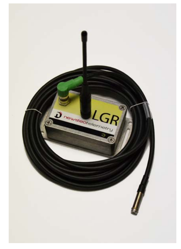
Figure 1: Example of a LGR data logger connected with an external probe