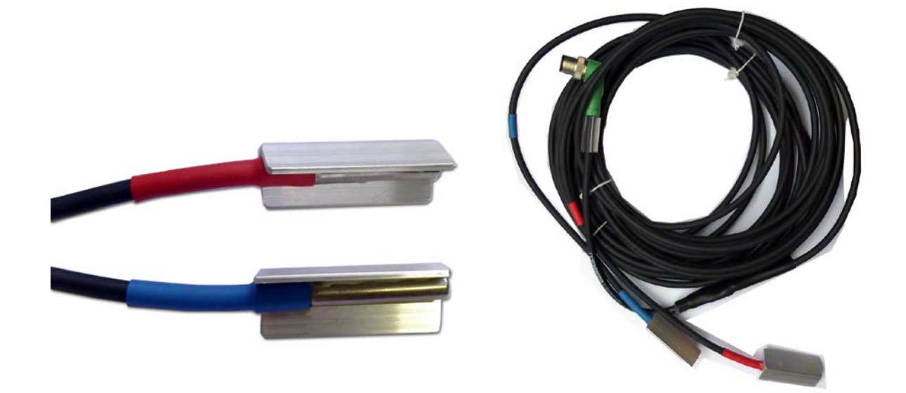
Figure 16: PFPN-STT51-003 probe