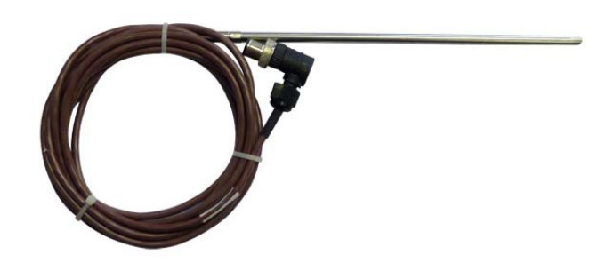
Figure 19: PFPN-STC32-001