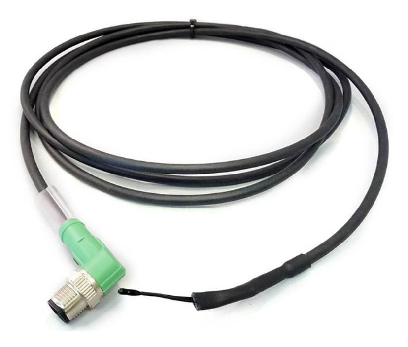
Figure 7: PFPN-SNT51-002 NTC probe