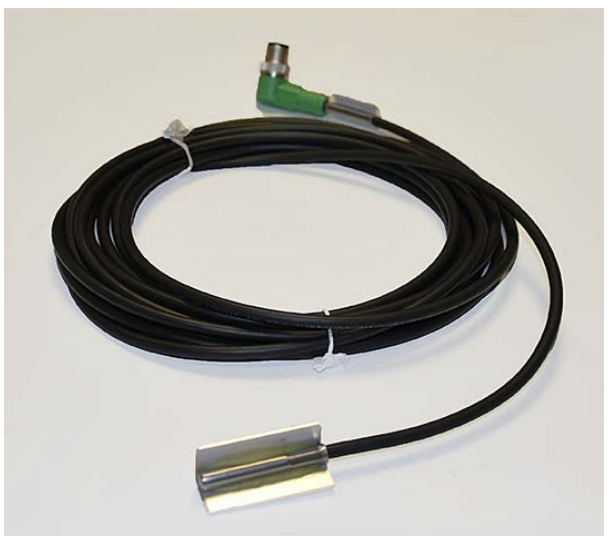
Figure 14: PFPN-STE51-005