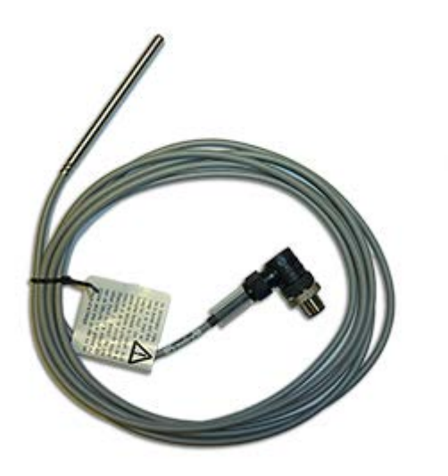
Figure 8: PFPN-STE33-001 PT1000 probe