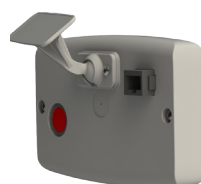
Truck cabin version